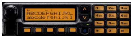
Two line setting display example

Using a high contrast LCD, the IC-F1721/F1821 series shows operating channels, tone and other settings clearly under nearly any lighting conditions. With a dot matrix display, upper and lower case characters can be easily distinguished. In addition, you can change the display setting to show one line and 12 characters, or two lines and 24 characters via programming.